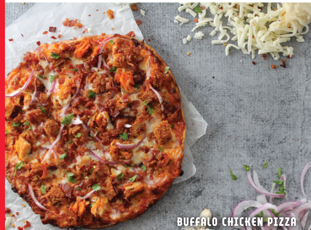
BUFFALO CHICKEN PIZZA