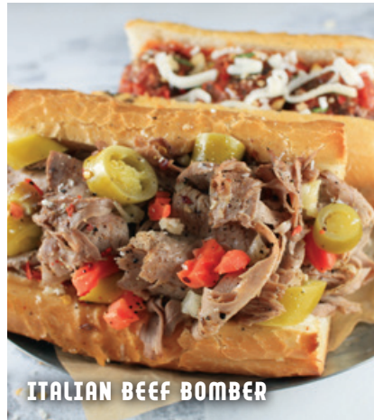
ITALIAN BEEF BOMBER