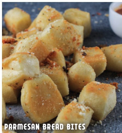
PARMESAN BREAD BITES